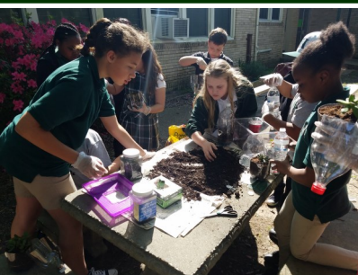
Coke bottle terrariums