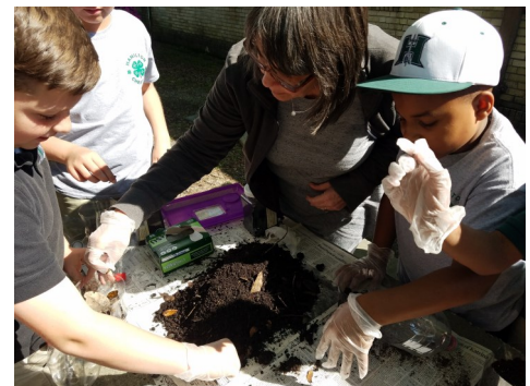
Coke bottle terrariums